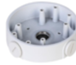
PFA139 Junction Box